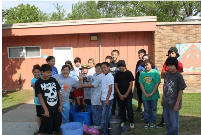
Learning about vermiculture (worms) and their role in dirt