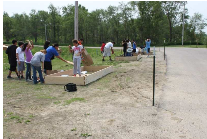
Building raised garden beds