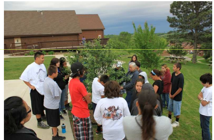
Learning how, why and when to prune trees